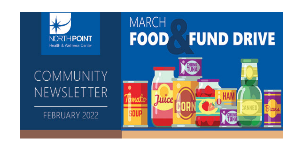
Pictured: March Food & Fund Drive